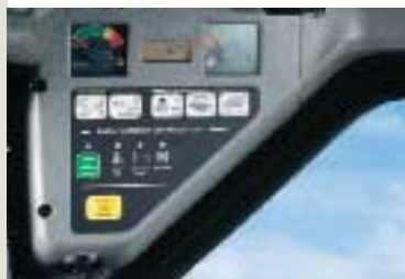
Left Side Standard Instrument Panel

State-of-the-art instrument panels provide dozens of operational features, diagnostics and monitoring. Optional deluxe instrument panel includes keyless start security system, feature lockouts, digital time and job clocks, multi-language display, even a "help" menu.