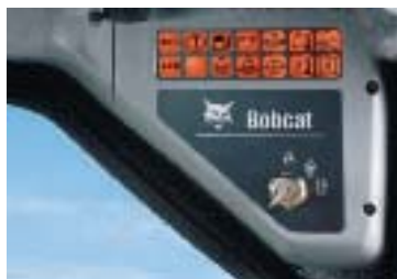
Right Side Standard Instrument Panel