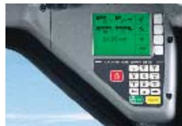
Optional Deluxe Instrument Panel