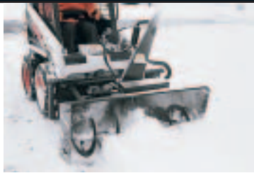
Snowblower Powerful snow mover. Discharge chute is controlled from operator's seat.