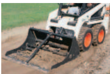
Landplane Removes large clods and rocks, breaks up hard ground, sorts debris from soil.