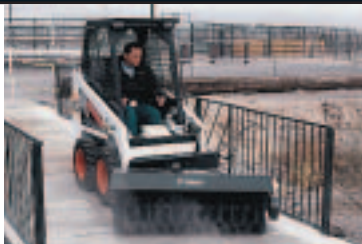
Angle Broom Sweeps snow, dirt and debris from driveways, loading docks and warehouse floors.