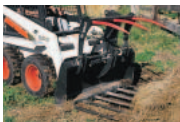
Utility Grapple Handles loose hay, straw, manure, bales and hard-to-grasp material. Use it with bucket or pallet fork.