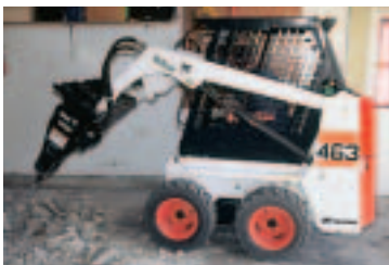
Breaker Breaks up concrete and asphalt quickly and effortlessly.