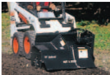
Tiller Digs and loosens soil; mixes compost and other materials into existing soil.