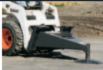
Mini Scraper Cleans ice and snow off parking lots; scrapes floors; removes tile flooring.