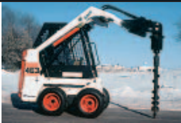
Auger Drills holes with speed and plumb-line accuracy.