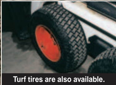
Turf tires are also available.

Standard BOB-TACH™ Mounting System Assures Fast, Secure Attachment Changes!