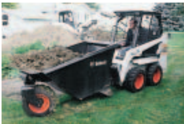
Dumping Hopper Loads quickly and saves time by hauling more material in fewer trips to the dumpsite.