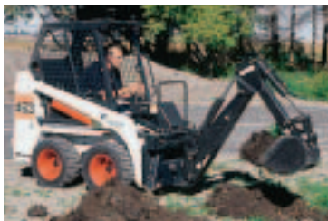
Backhoe Converts loader into a digging machine. Digging depths up to 5.5 ft.