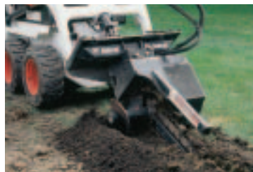
Trencher Handles a wide range of jobs, including trenching close to buildings.