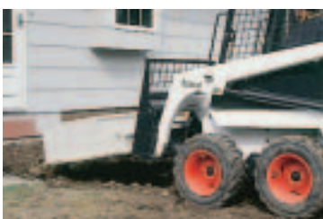
Pallet Fork Handles palletized material on farms, construction jobs and industrial sites.