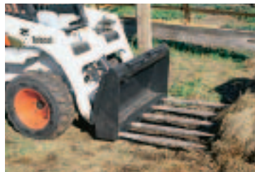
Utility Fork Grabs bulky, hard-to-handle material: loose hay, bedding, manure and bundled items.