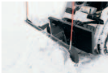
Utility Blade Use it as both a snow blade or dozer blade. Curved moldboard angles 30 degrees.