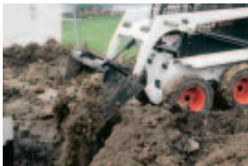
Buckets There's a bucket for every job, from digging to dumping.